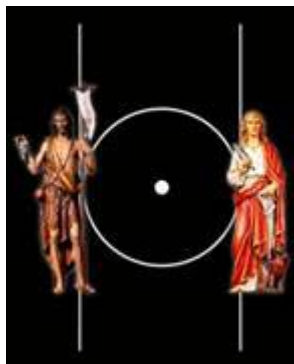
Holy Saints John

One element that Brown focuses on is the alchemical symbol of gold, something in Masonic circles is referenced to as the point within the circle, what Brown calls the circumpunct, that all Masons recognize as being flanked by the Holy Saint John’s and crowned with the Volume of the Sacred Law.